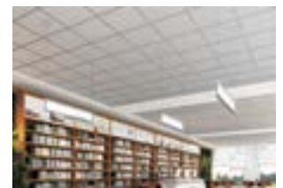
DROPPED CEILING MOUNTING KIT